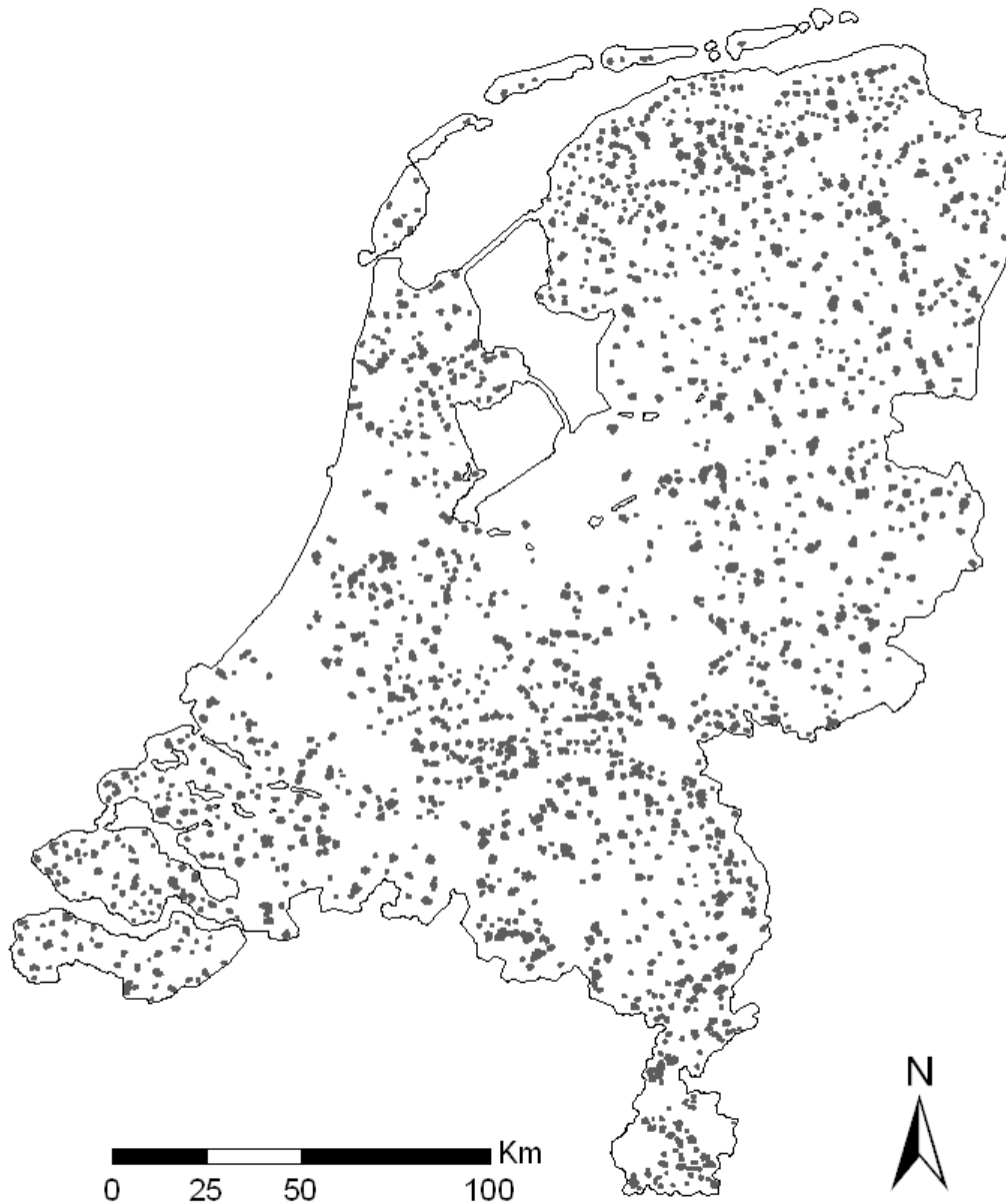
Figure 1: Small settlements of 11-5000 residences in the Netherlands

At the municipality level, the CBS data includes a variable called “urbanity”, which categorizes municipalities according to the average address density, on a scale of 1 (high) to 5 (low). A city such as Amsterdam would fall into the urbanity category 1. I chose to group municipalities of urbanity 1 and 2 as urban, and urbanity levels 3 to 5 as rural. In the table below are the criteria used by the CBS to define urbanity levels, together with my own labels (on the left). Figure 2 presents the five categories of urbanity in a visual manner.