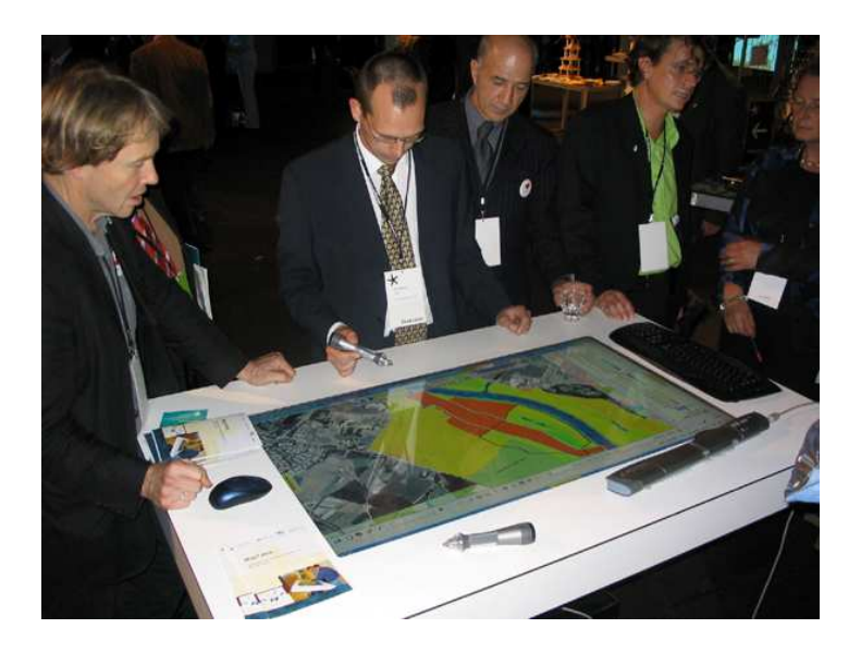
Figure 3: The MapTable in action. (borrowed from [1])

The current version of the MapTable is a pilot version. At the moment further developments are made to the system for improvement.