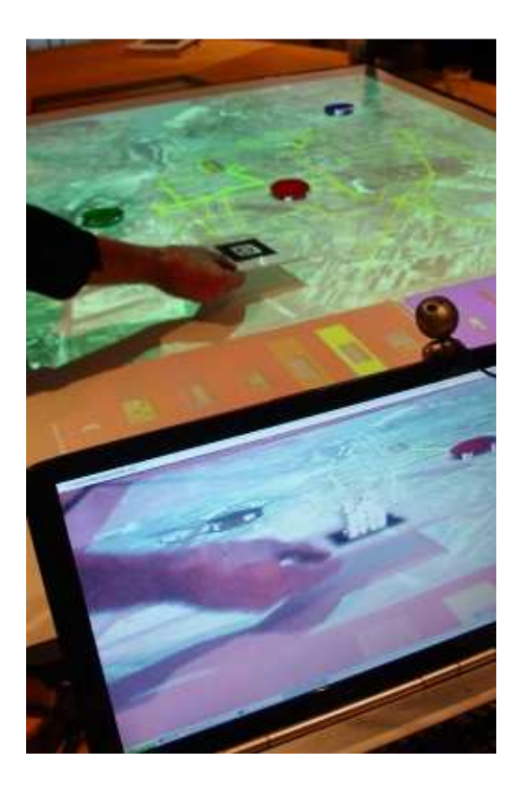
Figure 2: AR example: the tangible interface and its objects are shown on the top half of the picture. A person is holding a pattern over the table surface. In the bottom half of the image the picture captured by a simple web-cam can be seen. In the filmed image, instead of the pattern, a 3D model of an office building is visualised.