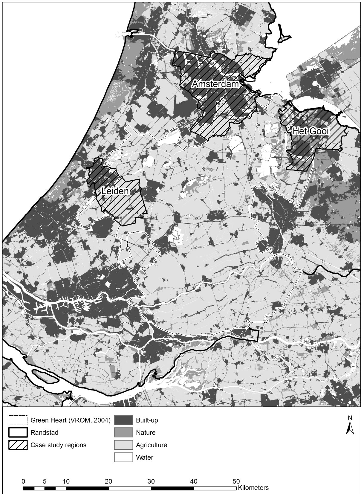
Figure 2. Location of the selected local housing market regions within the Dutch Randstad urban constellation.